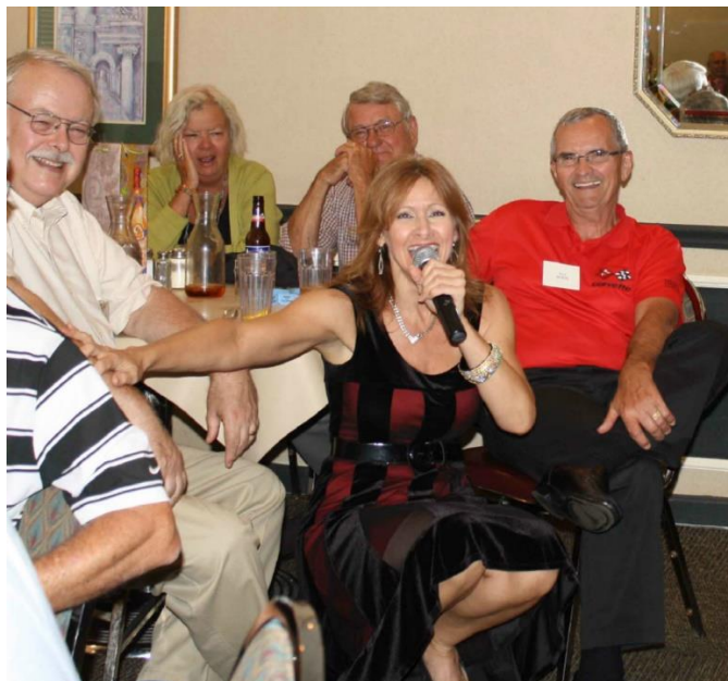
Serenading "the troops"